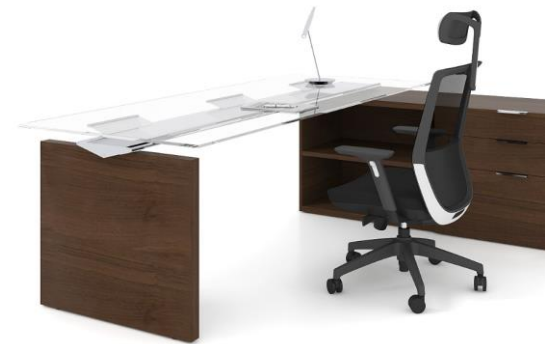
Available with a glass top