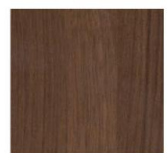
407 walnut esperia