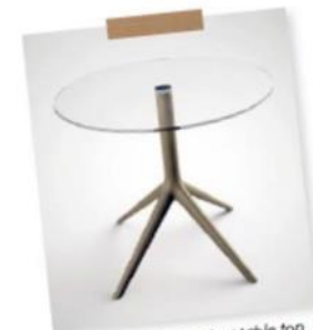
Mari-sol table with glass table top.