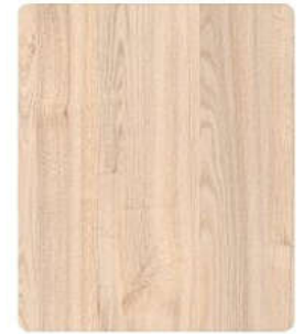
620 marone T