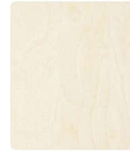
392 polar birch T