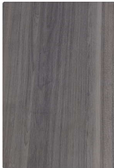
565 grey tourmaline T