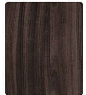
403 palisander santos T