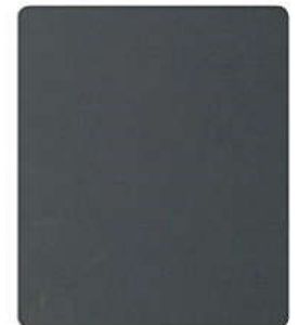
206 graphite S