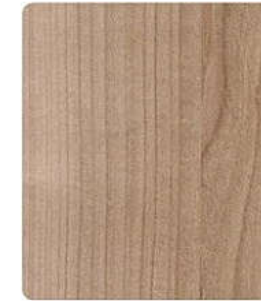
405 cherry morgana T