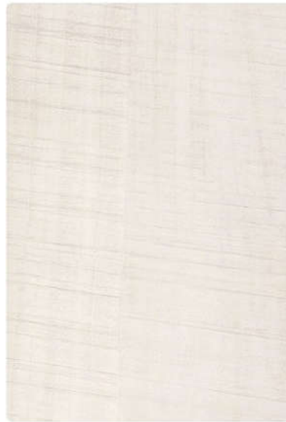
578 renew cherry T