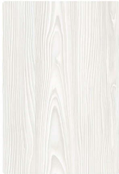
617 jackson pine T