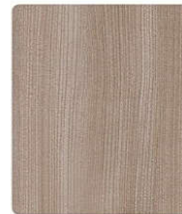
408 cherry grazia T