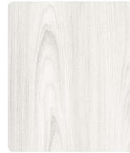
628 nussbaum T