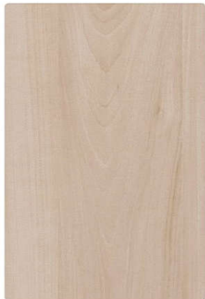
409 pear tree bonelli T