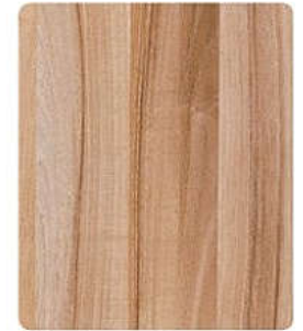
416 walnut tiepolo T