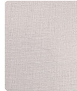
552 silk S