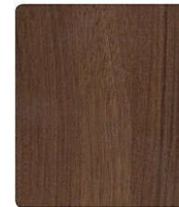
407 walnut esperia T